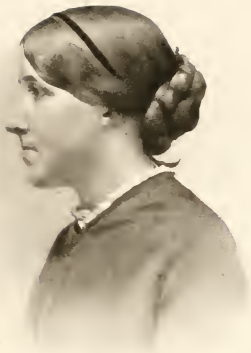
From a photograph of Miss Alcott taken about 1862.